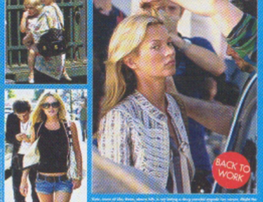
Kate Moss of the Olsen twins, above left, is posing in a very similar pose to the Olsen twins. (Right) The Olsen twins, above right, are posing in a very similar pose to the Olsen twins. (Right) The Olsen twins, above right, are posing in a very similar pose to the Olsen twins.