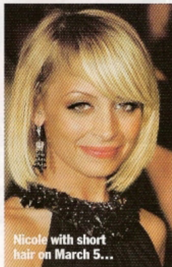
Nicole with short hair on March 5...